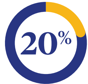
average retail gym membership savings with One Pass Select 3

Over 80% of U.S. consumers consider wellness a top or important priority in their daily lives. 1 One Pass Select ® is designed to encourage employee wellness through flexible gym and nutrition benefits. The program includes a low-cost national gym network, digital workouts, grocery delivery service and additional options. Best of all, your employees have the freedom to choose the option that fits their needs and lifestyle.